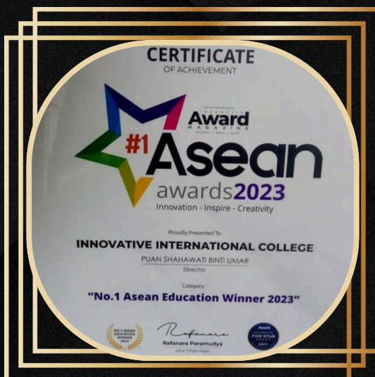
INDONESIA AWARD MAGAZINE NO.1 ASEAN EDUCATION WINNER 2023