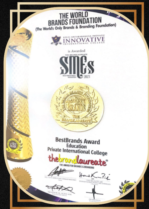
THE BRANDLAUREATE SMEs BESTBRANDS AWARD BUSINESS LEADERSHIP EDUCATION PRIVATE INTERNATIONAL COLLEGE 2023