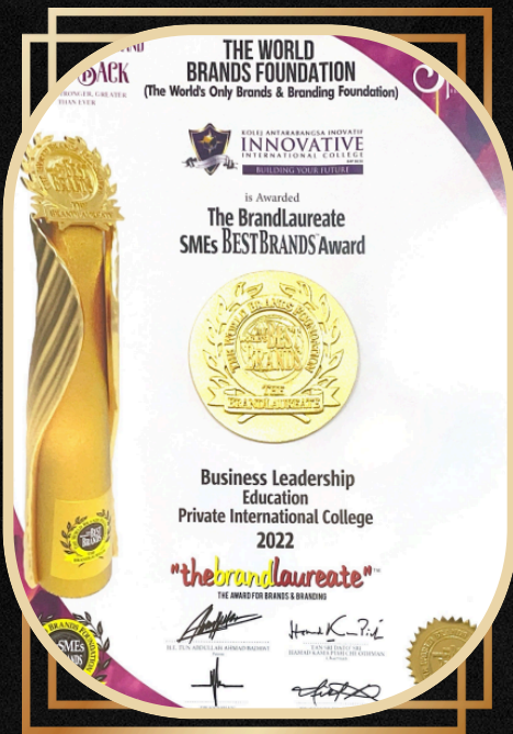
THE BRANDLAUREATE SMEs BESTBRANDS AWARD BUSINESS LEADERSHIP EDUCATION PRIVATE INTERNATIONAL COLLEGE 2022