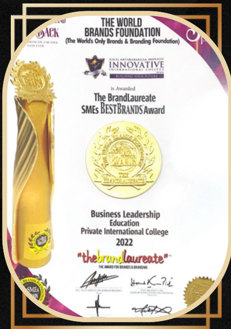
THE BRANDLAUREATE SMEs BESTBRANDS AWARD BUSINESS LEADERSHIP EDUCATION PRIVATE INTERNATIONAL COLLEGE 2022