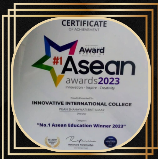
INDONESIA AWARD MAGAZINE NO.1 ASEAN EDUCATION WINNER 2023