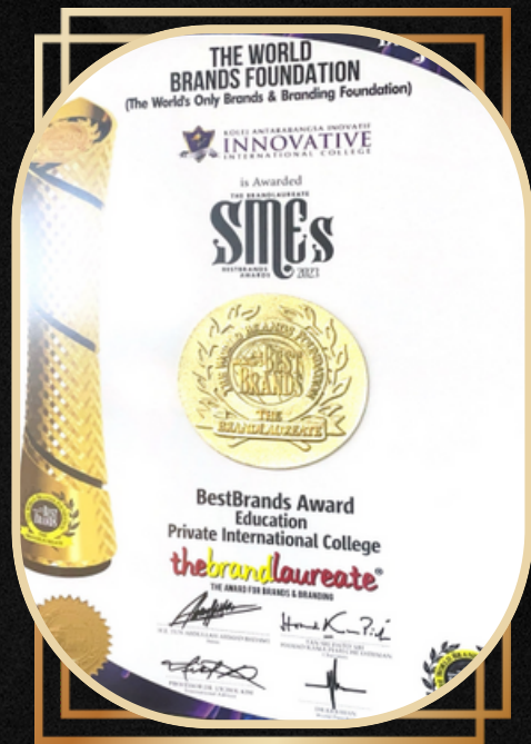
THE BRANDLAUREATE SMEs BESTBRANDS AWARD BUSINESS LEADERSHIP EDUCATION PRIVATE INTERNATIONAL COLLEGE 2023